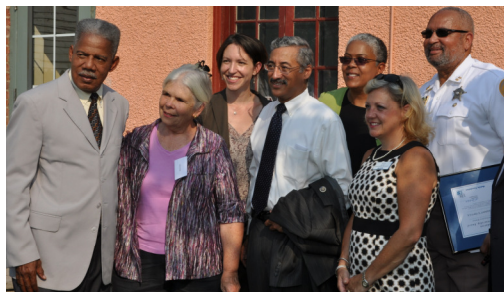
Representative Bobby Scott, and Senator Henry Marsh were present for the ceremony